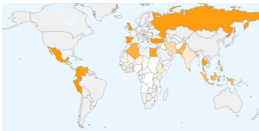
Map 1. Overall coverage of data on unemployment for the years 1991-2008

That data availability is extremely uneven is evident in the following maps. Map 1 shows the number of entries on unemployment in the years 1991-2008 for all countries that had conflicts in the same period . Only countries that experienced violent conflict are included, all other countries appear in grey; armed conflict data use a 'battleddeath' dataset. Although these maps show cases in which there is abundant data (shaded deeper orange), most of these countries had minor, sporadic or short spanning conflicts (Mexico, Venezuela, Spain and the UK). Clearly, there is insufficient data on unemployment for countries with significant battle-death levels in most of Sub-Saharan Africa, the Middle East and South Asia (with paler orange or white shading).