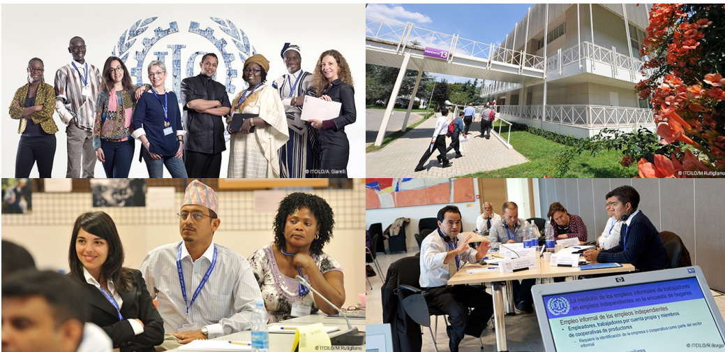
The ILO Centre's facilities

Located in an attractive park on the banks of the River Po, the Centre's campus provides a congenial environment in which to live and study.