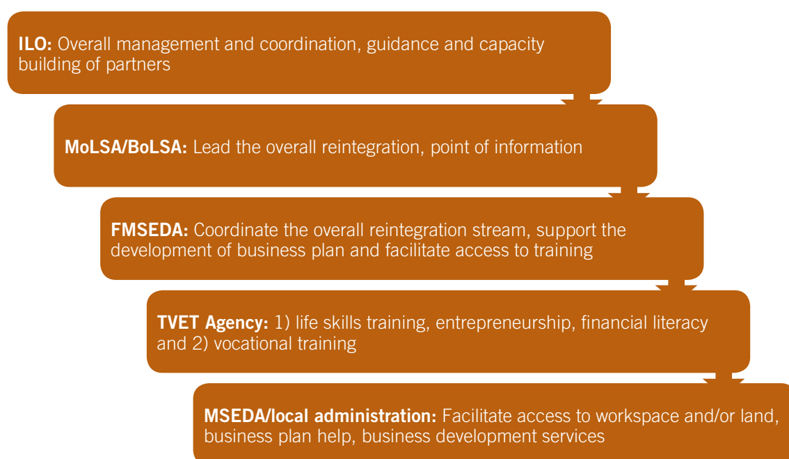
Figure 4. Actors directly providing services to returnees in support of economic reintegration